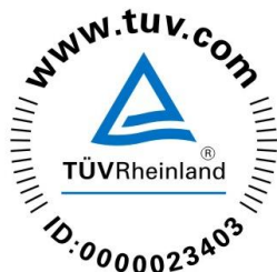
Figure 1, TUV logo

This manual provides safety and installation instructions for IEC-listed Gloria Solar photovoltaic (PV) modules carrying the TUV logo on the product label (Figure 1). Note. The actual ID number may vary.